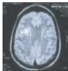
Fig. 2. VZV multifocal vasculopathy. Proton-density brain MRI scan shows multiple areas of infarction in both hemispheres, particularly involving white matter and extending to gray-white matter junctions.

The question arises whether primary VZV encephalitis exists at all, and earlier reports of clinical cases of encephalitis associated with varicella and zoster provide no definitive answer. MRI, which allows antemortem diagnosis of the focal nature of VZV vasculopathy, had not yet been developed, and none of the reports detailed histopathological findings.