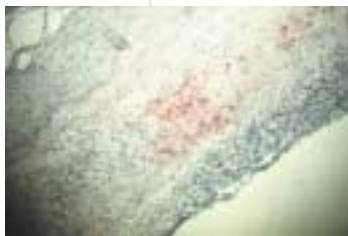
Fig. 1. Immunohistochemical analysis of cerebral artery from a patient with VZV vasculopathy. Note red staining VZV antigen after incubation of artery with rabbit antiserum against the VZV ORF 63 protein. x86.

VZV large artery disease (also known as granulomatous arteritis) predominates in elderly immunocompetent adults and is characterized by acute focal deficit that develops weeks to months after contralateral trigeminal-distribution zoster (shingles), rarely without a history of zoster. Vasculopathy is usually restricted to 1-3 large arteries in the anterior circulation (mostly the carotid, anterior and middle cerebral arteries). Cases of clinically unifocal large-vessel vasculopathy have also been described in children with varicella (chickenpox), thus making VZV one cause of acute infantile hemiplegia. Pathological analysis of affected arteries of clinically unifocal vasculopathy after zoster or varicella reveals multinucleated giant cells, Cowdry A inclusion bodies and herpesvirus particles (hallmarks of human herpesvirus infection) as well as VZV